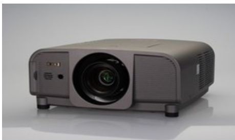
Eiki HI-RES digital projector

Media has also begun installing new Extron Switchers for our media console classrooms. These new switchers will ease the transition to the digital era.