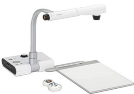
Elmo Document Camera

Digital technologies continue to grow and replace the old legacy analog devices we have all come to know over the past few years. At TC we are now preparing and implementing the changes for the new digital standards that will soon be in place nation-wide by 2013.